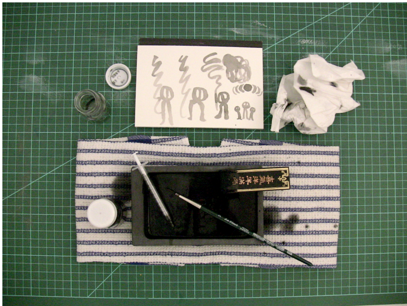
preparing the ink